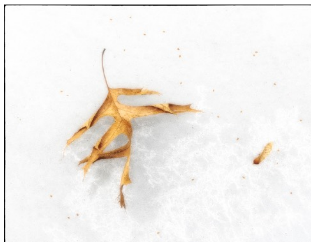
"Summer's Crescent Moon," left, and "Do You Wanna Dance?"